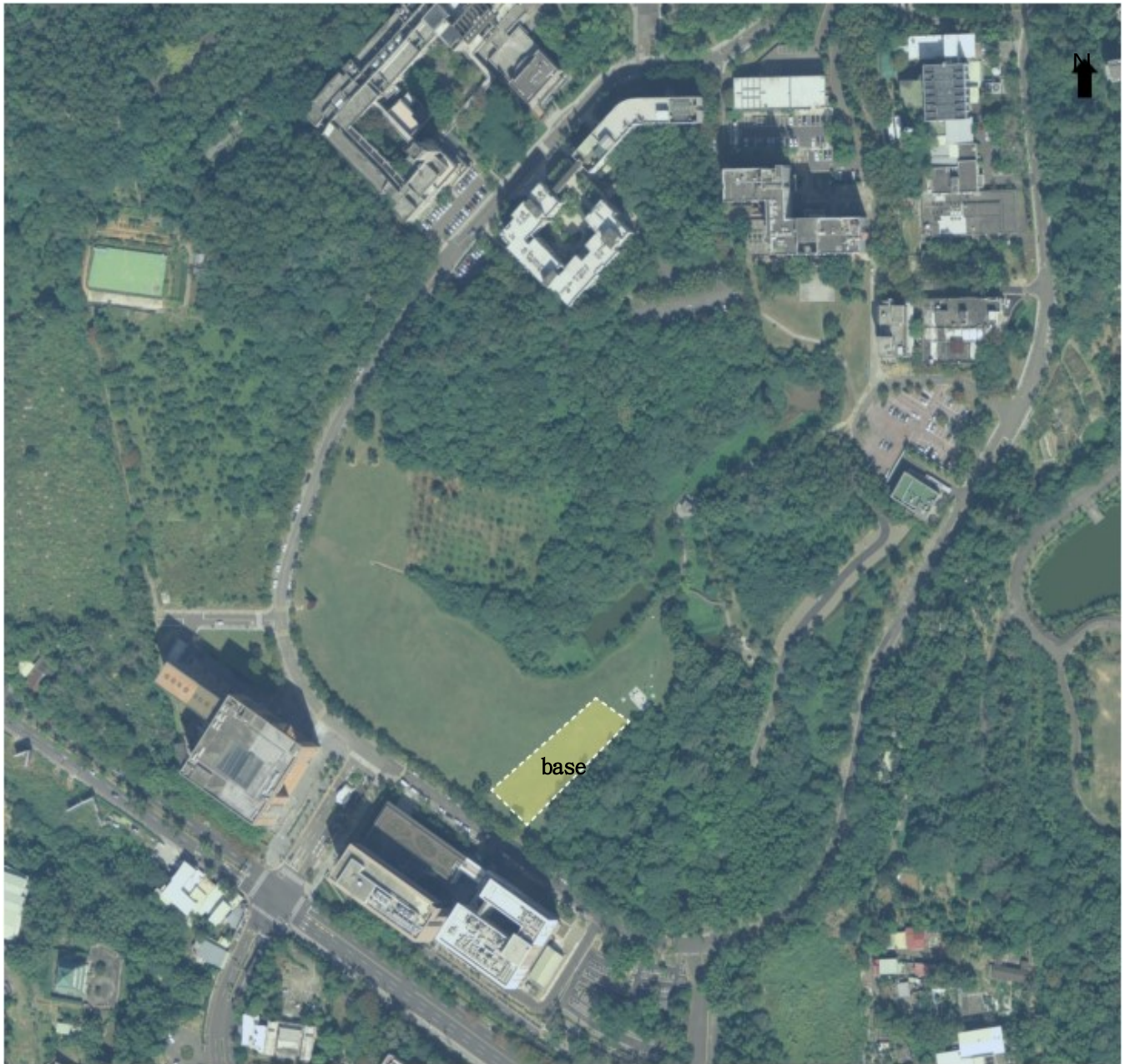
▲ Art gallery base drilling range aerial photo